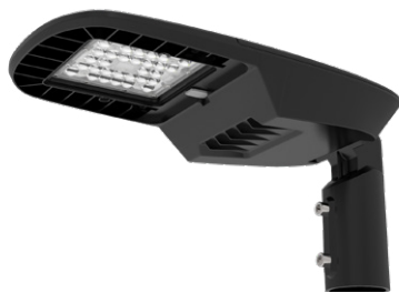
ROX-50 - 100W