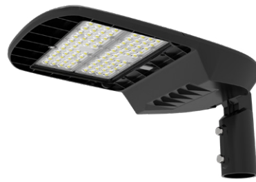
ROX 150W - 200W